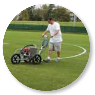
Easily paints circles and arcs.