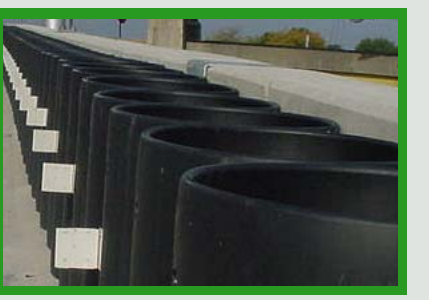
After a design lateral impact, the CushionWall II System regains a high percentage of its original shape without maintenance or repair.