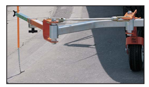
...while looking forward!

The trailing wheel of the Line Tracking System transfers motion to the indicator to show where the spray guns will follow.