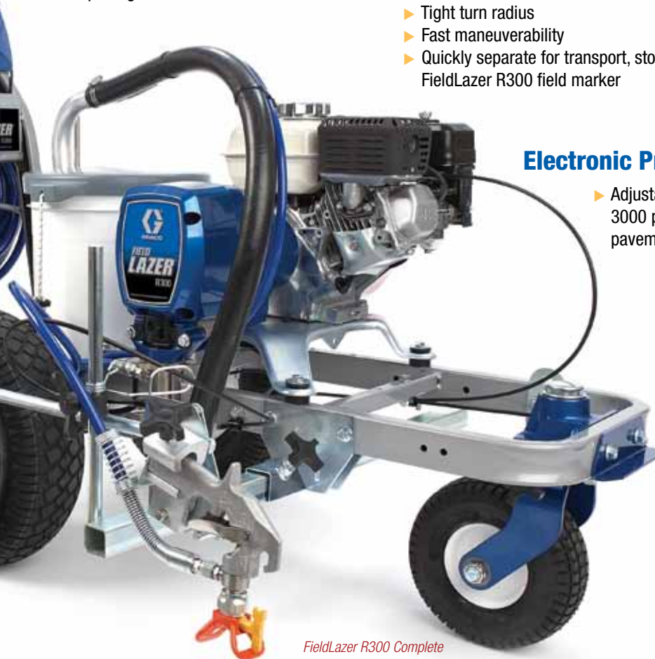
FieldLazer R300 Complete