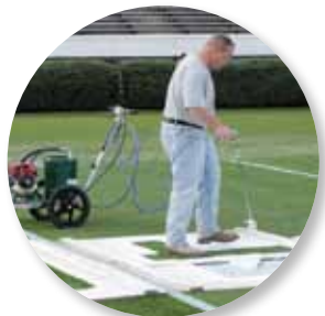
No-tool gun removal for spraying stencils or large solid areas.