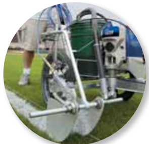
Designed to deliver long straight lines