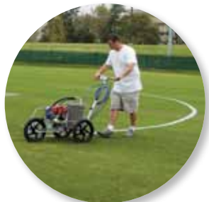
Easily paints circles and arcs.