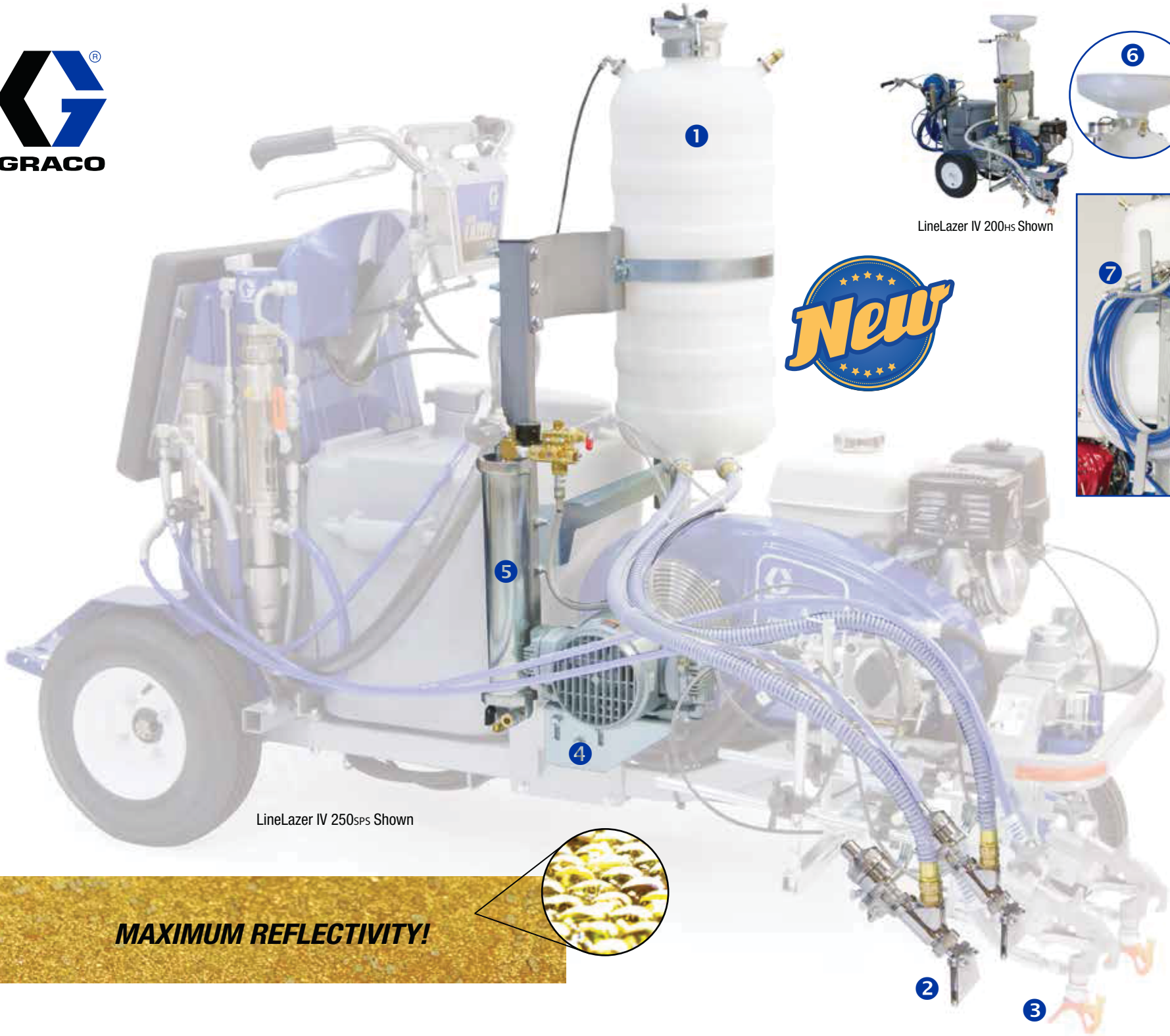
LineLazer IV 250sps Shown