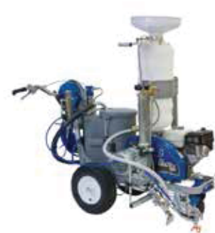
LineLazer IV 200hs Shown